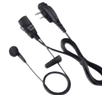
HM-166LA Light weight earphone microphone