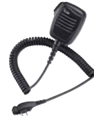
HM-159LA Full size durable speaker-microphone