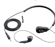
HS-97 + VS-4LA or OPC-2004LA* Throat microphone with earphone

* Either VS-4LA or OPC-2004LA is required when using HS-97 headset. VS-4LA: PTT switch cable for manual PTT operation OPC-2004LA: Plug adapter cable for VOX hands-free operation HS-94 and HS-95 also can be used with either VS-4LA or OPC-2004LA.