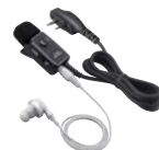
HM-153LA Lapel type microphone with earphone