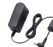
AC adapter BC-123SE/SUK*