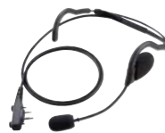
HS-95LWP Behind-the-head type with boom microphone for hands-free operation